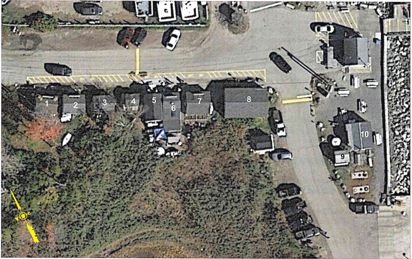
EXHIBIT A - RYE HARBOR RIGHT OF ENTRY OVERVIEW AERIAL IMAGE

DESIGNED BY: MCR DATE: 05/01/2023 SCALE: N.T.S.